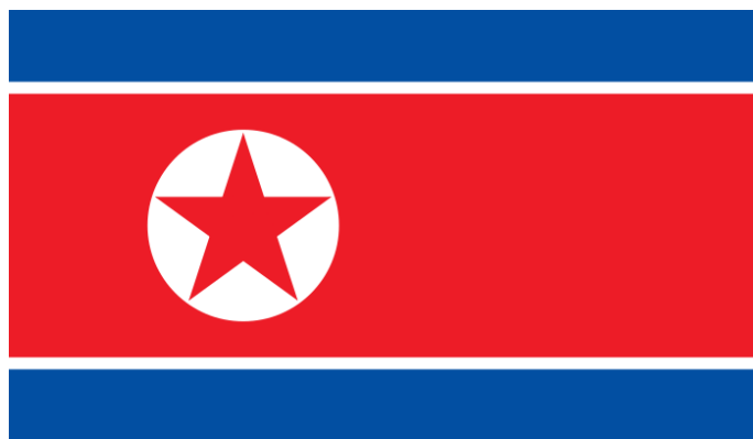
The Democratic People's Republic of Korea (The DPRK)

建議七要求各地執行針對性財政制裁，以落實聯合國安理會針對防止大規模毀滅武器擴散的決議