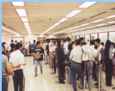
Public Search Hall