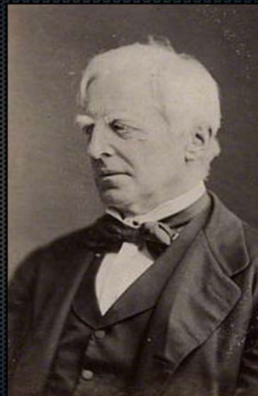
Robert Lowe, Deputy of Board of Trade (later Chancellor of the Exchequer)

it is essential to give “the greatest publicity to the affairs of... companies, that everyone may know on what grounds he is dealing”