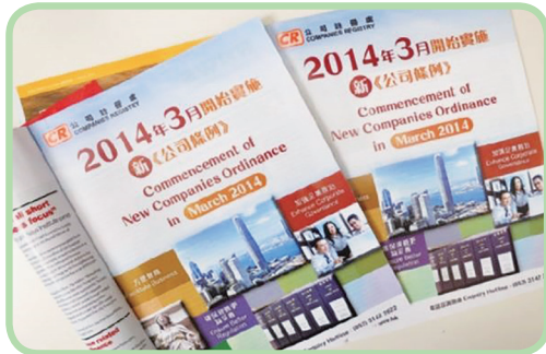
新《公司條例》於三月三日實施 Implemented the new Companies Ordinance on 3 March