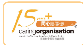
在「同心展關懷／商界展關懷」計劃中， 獲頒連續15年或以上「同心展關懷」標誌 Received the “15 Years Plus Caring Organisation” Logo awarded under the Caring Organisation/Company Scheme