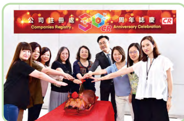
慶祝本處成立三十周年 30 th Anniversary of the Registry