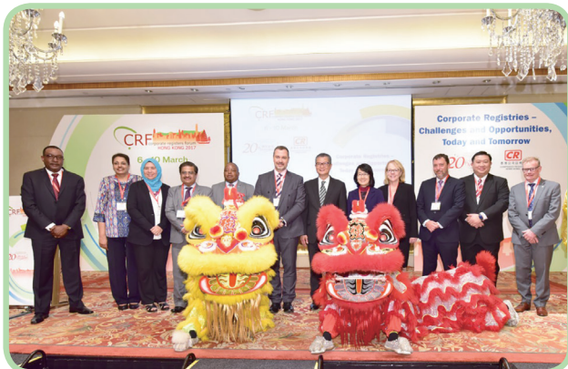
舉辦兩個大型會議 – 「2017公司註冊論壇」及「企業管治圓桌會議」 Organised two major conferences – Corporate Registers Forum 2017 and the Corporate Governance Roundtable