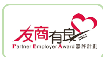
榮獲2022「友商有良」卓越企業嘉許狀 Received the 2022 "Partner Employer" Award