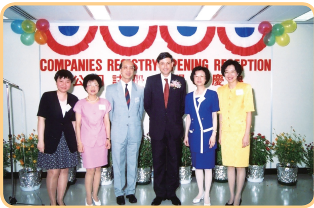
於五月一日成立為獨立的政府部門， 並於八月一日成為營運基金 Established as an independent government department on 1 May and as a trading fund on 1 August