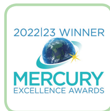
本處年報贏得多個獎項，包括 「2022年Astrid國際年報大獎」、 「2022年國際年報比賽」及 二零二二至二三年度「MERCURY國際年報大獎」中的獎項 Received various awards for the Registry’s Annual Report – the Astrid Awards 2022, the 2022 International Annual Report Competition Awards and MERCURY Excellence Awards 2022-23