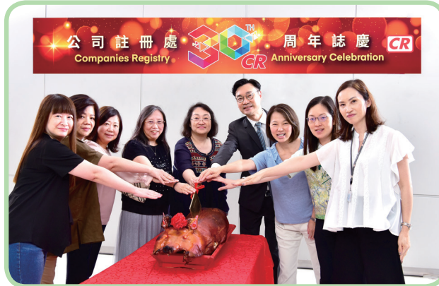
慶祝本處成立三十周年 30 th Anniversary of the Registry