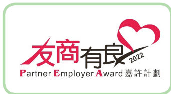
榮獲2022「友商有良」卓越企業嘉許狀 Received the 2022 “Partner Employer” Award