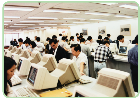
推出電腦化的上市公司董事索引， 以及顯示已註冊公司交付本處登記的所有文件的文件索引 Introduced the computerised index of directors of listed companies and document index of all the documents filed by registered companies