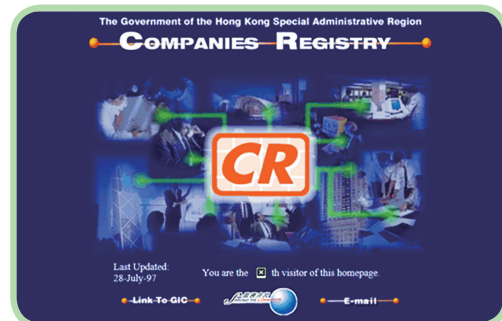
推出公司註冊處網站 Launched the Companies Registry's website