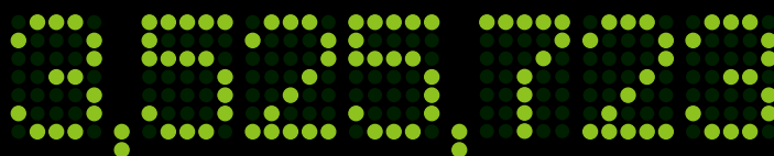
二零一二至一三年度查閱文件影像紀錄的個案數目 Number of searches of document image records during 2012-13

Customers can register as CSC registered online users by paying an annual fee and enjoy lower rates for searching image records. They can also enjoy the convenience of having the search fees deducted from their prepayment accounts. As of 31 March 2013, over 2,200 customers including financial institutions and professional firms had registered as online users and given very satisfactory feedbacks to the services. For unregistered users, popular payment methods such as credit card payment or PPS by Internet are available for settling search fees online.