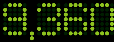
平均每個工作天提交本處登記的文件數目 Average number of documents received each working day

In 2012-13, the number of documents registered with the Registry has increased by about 7.5 per cent to 2,293,355. This represents an average of 9,360 documents received every working day for registration by the Registry.