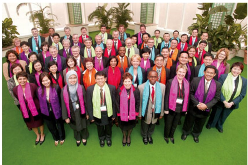
主辦公司註冊論壇2006 Hosted the Corporate Registers Forum 2006

展開重寫《公司條例》的工作 Commencement of the rewrite of the Companies Ordinance