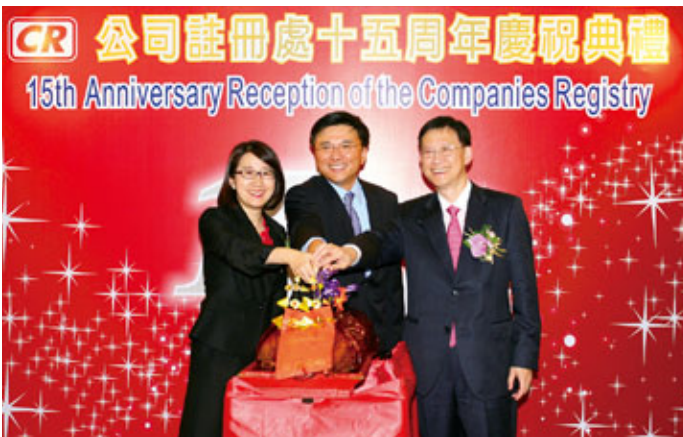
公司註冊處成立15周年 15 th Anniversary of the Registry

推出「一站式公司註冊及商業登記服務」 Introduction of one-stop service for company incorporation and business registration