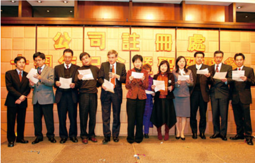
公司註冊處成立10周年 10 th Anniversary of the Registry

制定《2003年公司（修訂）條例》，以便引入「一名成員組成的公司」及推行「公司註冊處綜合資訊系統」第一階段等