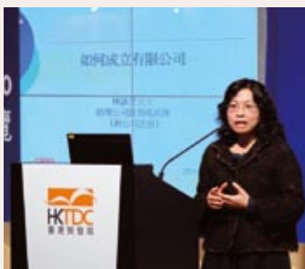
公司註冊處人員在「國際中小企博覽2011」上發表「電子公司註冊」簡報。 The Companies Registry makes a presentation on e-Incorporation at the World SME Expo 2011.