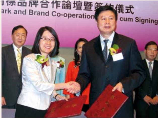
公司註冊處處長與寧波市工商行政管理局簽訂合作協議。 The Registrar of Companies signs a Cooperation Agreement with the Ningbo Administration for Industry and Commerce.