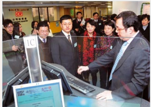
安徽省及山東省工商行政管理局代表團到訪公司註冊處。 A delegation from the Anhui and Shandong Administration for Industry and Commerce visits the Companies Registry.