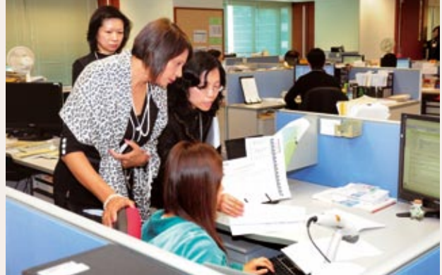
毛里裘斯公司註冊處處長到訪公司註冊處。 The Registrar of Companies of Mauritius visits the Companies Registry.