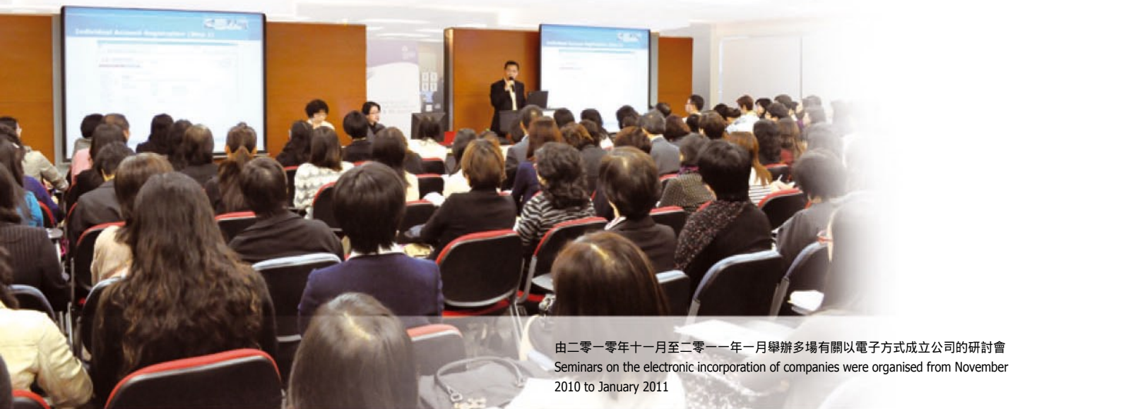
由二零一零年十一月至二零一一年一月舉辦多場有關以電子方式成立公司的研討會 Seminars on the electronic incorporation of companies were organised from November 2010 to January 2011