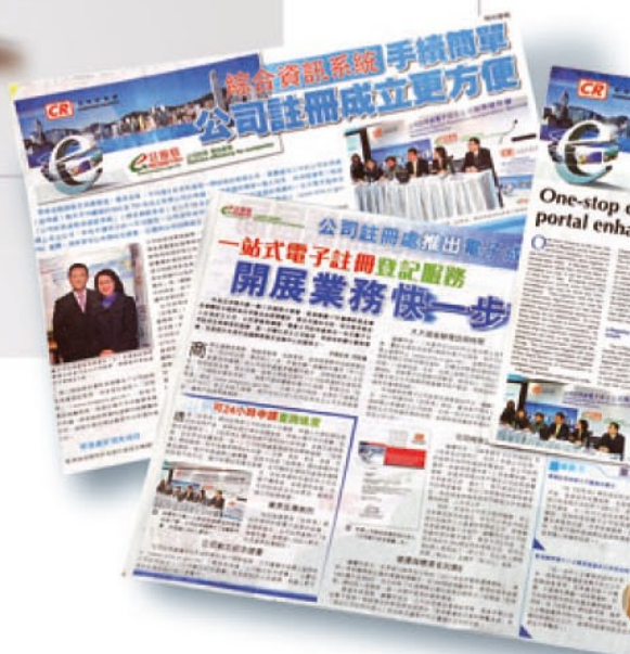
在四份本地報章刊登「註冊易」的專題文章 Featured articles on the e-Registry were published in four local newspapers