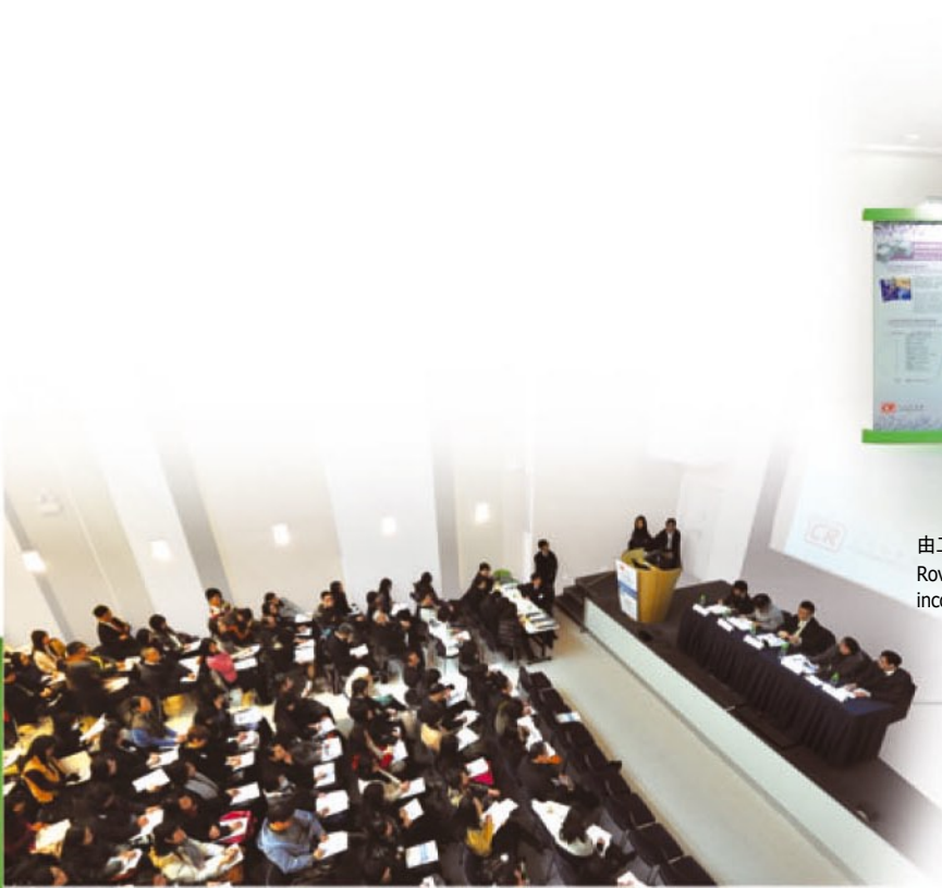
於二零一一年一月舉辦五場「註冊易」發布會 Five briefing sessions at the e-Registry Marketing Conference were held in January 2011

To promote public awareness of the new electronic services, a wide range of publicity activities were held, including the following.