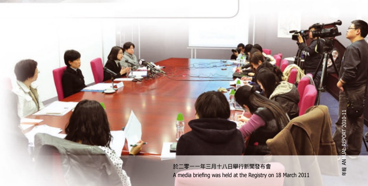
於二零一一年三月十八日舉行新聞發布會 A media briefing was held at the Registry on 18 March 2011