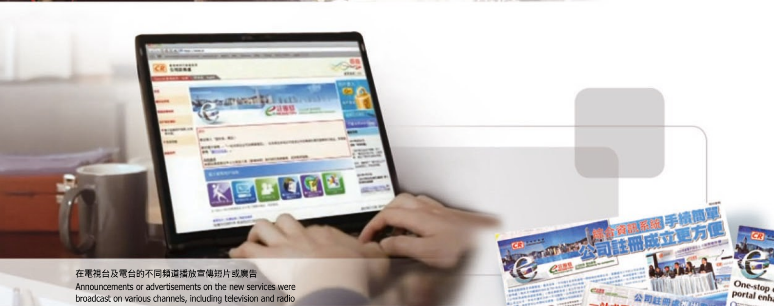
在電視台及電台的不同頻道播放宣傳短片或廣告 Announcements or advertisements on the new services were broadcast on various channels, including television and radio