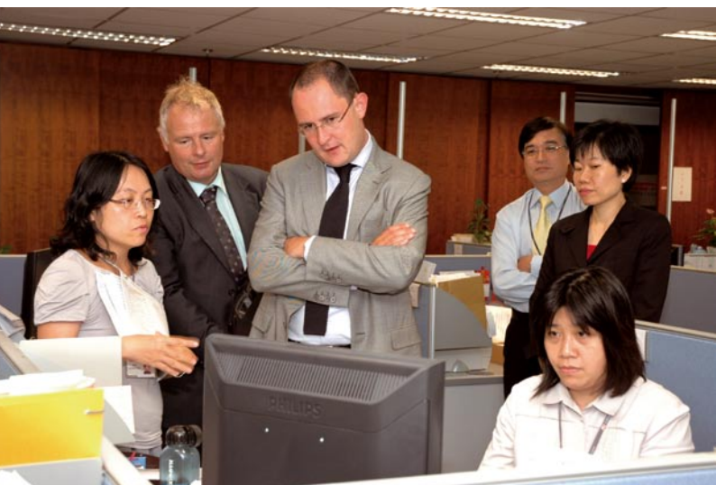
比利時經濟與改革部部長訪問本處 The Minister for Economy and Reform of Belgium visiting the Registry

As in the past, attachment programmes to the Registry for Mainland officials from the State Administration for Industry and Commerce and the provincial office of Shanghai and Ningbo were organised. An attachment programme was also arranged for an official from the Samoa International Finance Authority in October 2008. For the first time, two of our senior officers were attached to the State Administration for Industry and Commerce and the Beijing Administration for Industry and Commerce in November 2008. These attachment programmes provided good opportunities for our staff in enhancing their understanding of company registration practice and regulatory frameworks in other jurisdictions.