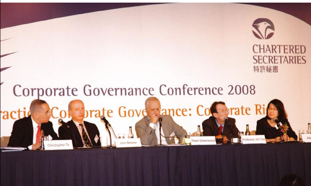
參加「企業管治會議2008」 Participating in the Corporate Governance Conference 2008

To showcase our services to the business community, the Registry participated in the Directors' Conference 2008 organised by The Hong Kong Institute of Directors in April 2008, the Corporate Governance Conference 2008 organised by the Hong Kong Institute of Chartered Secretaries in September 2008 and the World Small and Medium-sized Enterprises Expo 2008 organised by the Hong Kong Trade Development Council in December 2008.