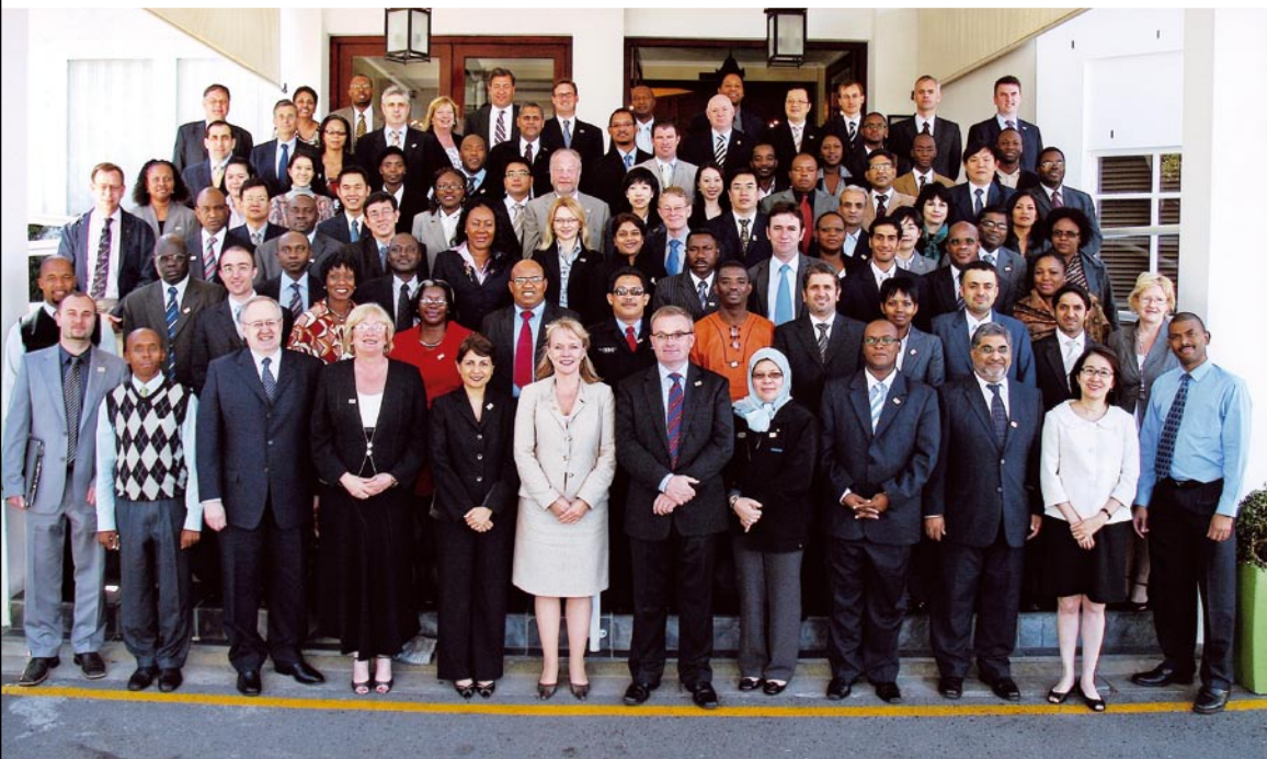
在南非開普敦出席「第六屆公司註冊論壇」的代表 Delegates to the 6th Corporate Registers Forum in Cape Town, South Africa

From April to July 2008, our Registry Solicitor also joined the Hong Kong delegation in attending Face-to-Face Meeting of the Financial Action Task Force (FATF) in Paris, the Third Plenary Meeting of FATF in London and the Asia / Pacific Group Annual Meeting in Bali.