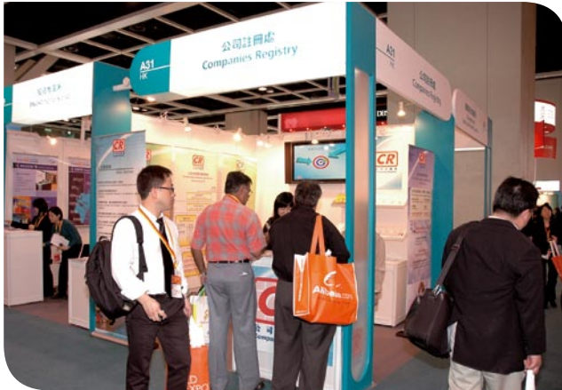
本處參加「中小企國際市場推廣日」 Participating in the World Small and Medium-sized Enterprises Expo

To showcase our services to the business community, the Registry participated in the World Small and Medium-sized Enterprises Expo organised by the Hong Kong Trade Development Council in December 2007.