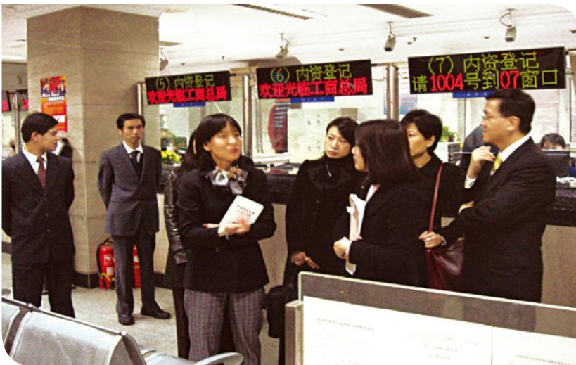
到北京訪問國家工商行政管理總局 Visiting the State Administration for Industry and Commerce, Beijing

In November 2007, the Registrar of Companies, leading a delegation comprising senior officials from the Financial Services and the Treasury Bureau and the Registry, visited the Ministry of Commerce of the Central People's Government, the State Administration for Industry and Commerce and the Beijing Administration for Industry and Commerce. One of our Deputy Principal Solicitors also attended the 11th Beijing - Hong Kong Economic Cooperation Symposium in Beijing on the subjects of corporate restructuring, merger and acquisition, and liquidation of companies.