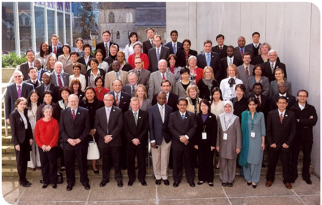
出席溫哥華「第五屆公司註冊論壇」的代表 Delegates to the 5th Corporate Registers Forum in Vancouver

To foster links with overseas registries, the Registrar of Companies also led a delegation of senior officials to attend the fifth Corporate Registers Forum in Vancouver, Canada, from 31 March to 4 April 2008. The Forum was attended by 80 delegates representing 30 jurisdictions and the World Bank. The Forum provided an excellent opportunity for establishing and fostering links with other registries, especially those with comparable legal, registration or regulatory systems. At the Forum's annual general meeting, Hong Kong was elected as a member of the Executive Council of the Forum for a term of two years from 2008-09. Hong Kong was also appointed as the Treasurer for the Forum.