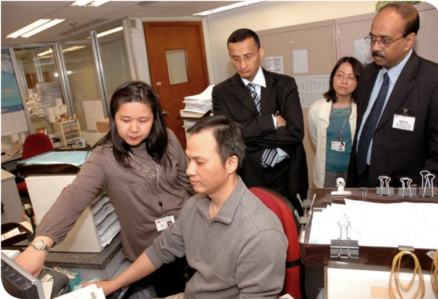
杜拜科技及傳媒自由區管理局 代表團訪問本處 A delegation from the Dubai Technology and Media Free Zone Authority visiting the Registry

一如過往，本處為來自國家工商行政管理總局，以及上海市、江蘇省和浙江省工商行政管理局的內地政府官員安排實習計劃。此外，在二零零七年十二月初，杜拜科技及傳媒自由區管理局的兩名總監亦到本處實習交流。這些實習計劃讓參加者加深認識香港的公司註冊制度及本處的運作情況，而本處人員亦可藉機會了解內地及其他司法管轄區企業註冊制度的最新發展。在討論期間，大家就不同司法管轄區的相關法例改革交流經驗。