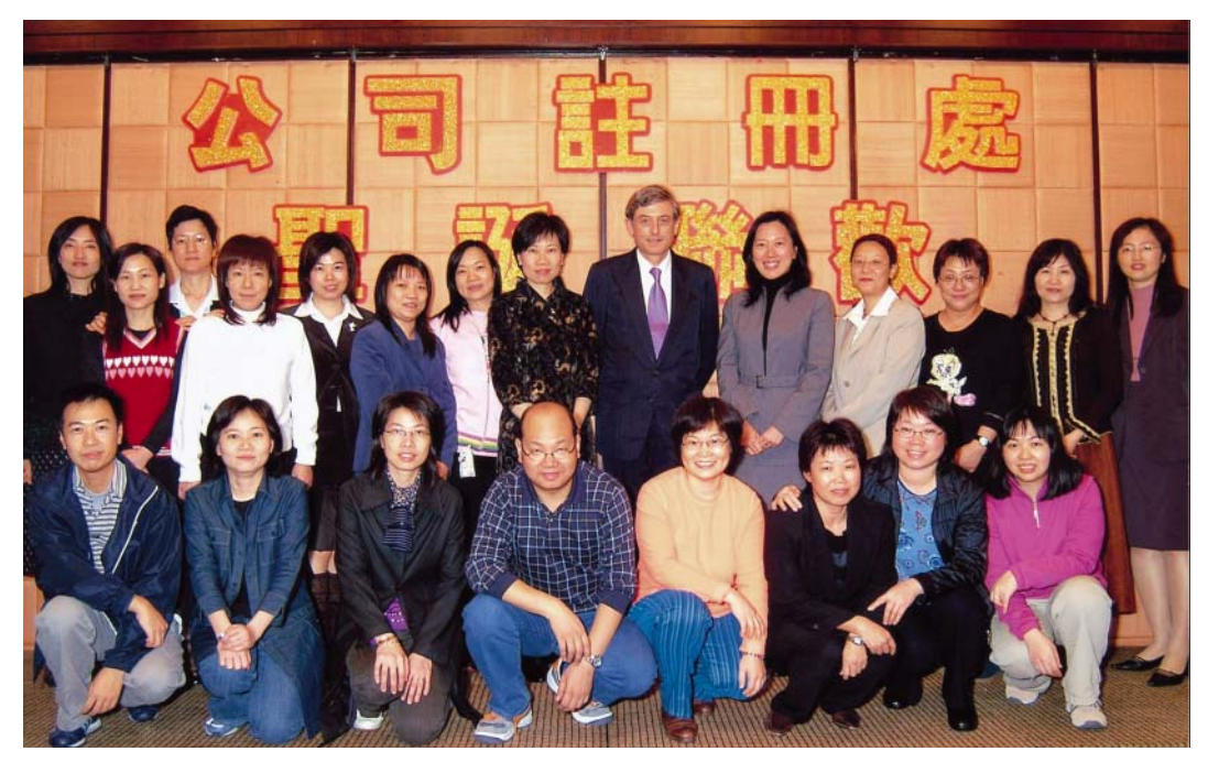
聖誕聚餐 The Christmas Dinner

公司註冊處處長和首長級人員在聖誕聚餐席上向同事祝酒 The Registrar of Companies and Directorate officers proposing a toast at the Christmas dinner