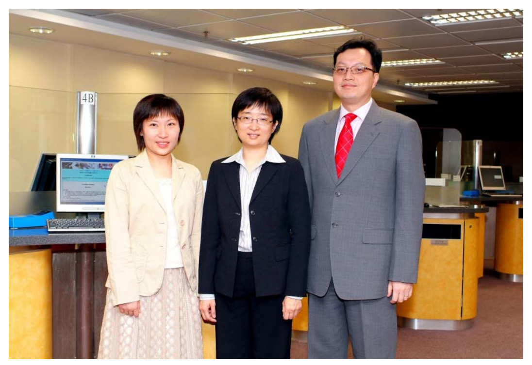
公眾查冊部的管理人員 Managers of the Public Search Division