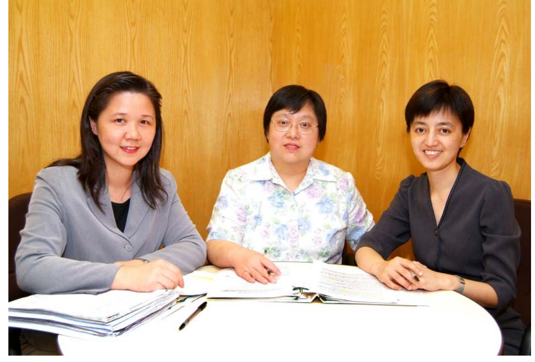
公司文件註冊部的管理人員 Managers of the Registration Division