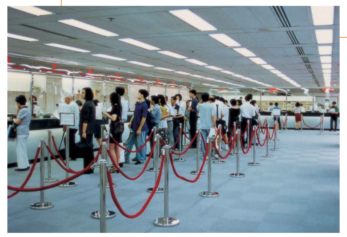
金鐘道政府合署14樓新收款處 The new shroff office on the 14th Floor Queensway Government Offices