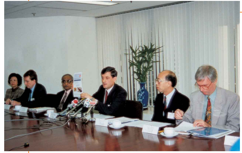
在一九九四年向傳媒介紹服務承諾和設施 Introducing new performance pledge and facilities to the media in 1994