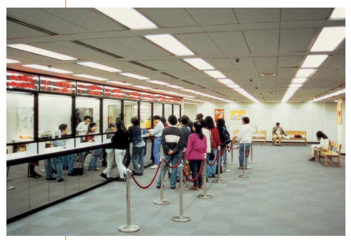
新公眾查冊大堂 The new Public Search Hall