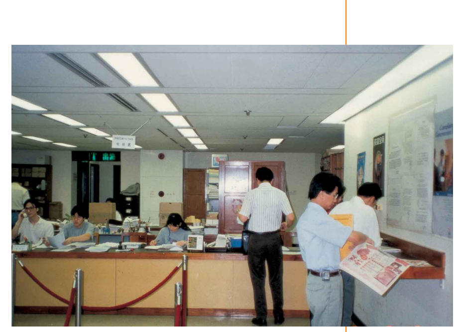
公司成立及條例執行部舊收發櫃檯 The old receipt and despatch counter of the Company Formation and Enforcement Division