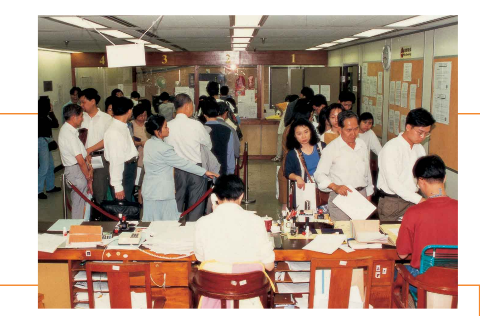
金鐘道政府合署14樓舊收款處 The old shroff office on the 14th Floor Queensway Government Offices