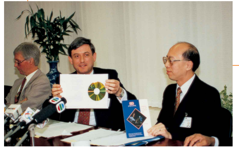
一九九六年向傳媒介紹新的電腦化公司名稱及文件索引 Introducing the new computerised company name and document indices to the media in 1996