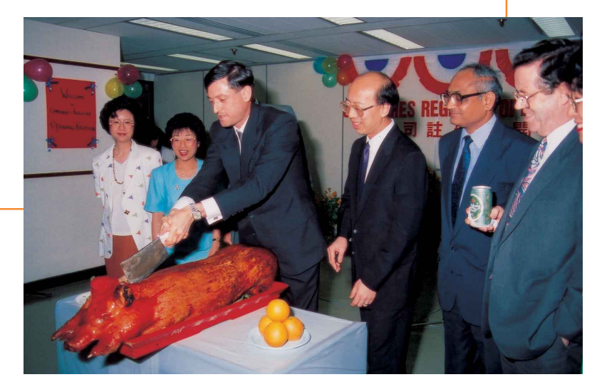
標誌着公司註冊處在一九九三年成為獨立政府部門的儀式 Marking the establishment of the Companies Registry as an independent government department in 1993

公司註冊處處長在一九九三年的「公司註冊處開幕慶典」致辭 The Registrar of Companies delivering a speech at the Companies Registry Opening Reception in 1993