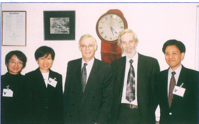
本處的策略性改革計劃研究組造訪 英國公司註冊處 Visit by our Strategic Change Plan Study Team to Companies House, United Kingdom

在策劃未來動向時，汲取海外註冊處的經驗及取得其運作及發展方面的最新資料，均至為重要。本處曾於一九九九年二月造訪英國的公司註冊處，取得其文件處理運作及電子存檔的最新發展兩方面的資料。此外，本處亦會參考其他國家的相關經驗，繼續尋求及研究適合的運作模式。