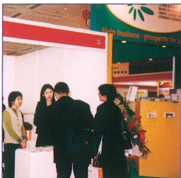
在中小型企業展覽會內解答查詢 Answering enquiries in the Small & Medium Enterprises Exhibition

本處在一九九九年二月參加了中小型企業展覽會。該展覽會旨在推廣各政府部門、支援機構、高等教育機構及工貿組織為這些企業提供的支援服務及設施。除了設立櫃檯，答覆市民對本處服務的查詢，並示範如何查閱互聯網上的公司名稱索引和文件索引，以及本處網址上的運作資料外，本處亦派發了逾一千八百份資料小冊子及表格給訪客。