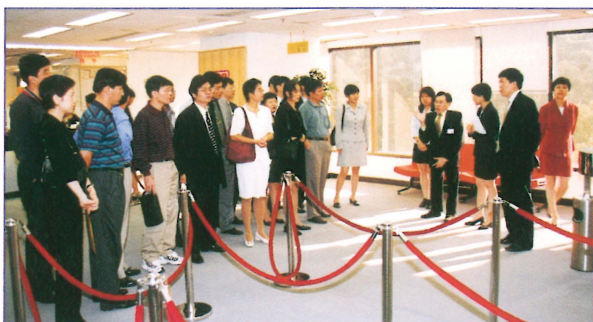
經中華人民共和國國務院港澳事務辦公室港澳研究所主辦的培訓計劃的學員訪問本處 Visit by participants in a training programme organized by the PRC State Council's Office of Hong Kong and Macao Affairs Research Institute

一九九八年十一月，香港公司秘書公會經本處及特許秘書與行政人員公會共同協力下，在香港舉辦了一個有關公司管治的國際公司秘書會議。主旨發言的講者及其他在全體會議上的演講者都是來自世界各地公司管治方面的權威人士，包括有學者、商人、執業人士及監管人等。整體而言，該會議在籌辦、專業內容及公共關係方面均十分成功。本處設置的專櫃亦引起與會人士對本處服務的興趣。