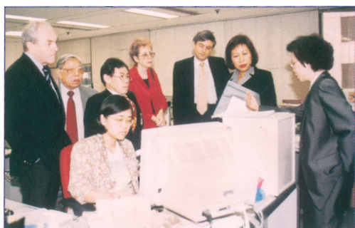
出席國際公司秘書會議研討公司管治問題的部分海外講者和與會人士參觀本處 Visit by some of the overseas speakers and participants in the International Company Secretaries Conference on Corporate Governance

一九九九年二月，本處的策略性改革計劃研究組造訪英國的公司註冊處，以求更瞭解其運作及在電子存檔方面的最新發展情況，從而有助該組草擬本處的策略性改革計劃。