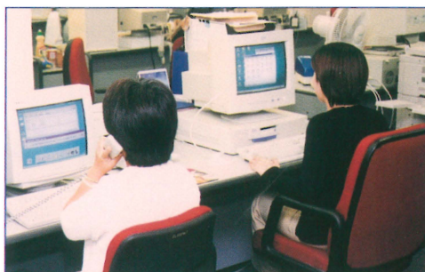
本處新設的電話諮詢熱線 2234 9933 The new enquiry hotline

The Registry participated in the Small and Medium Enterprises Exhibition in February 1999. The exhibition aimed to promote the services and facilities provided to those enterprises by various government departments, support organizations, higher education institutions, and industrial and trade