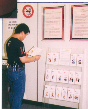
客戶在使用本處的資料小冊子 Customer making use of our information pamphlets