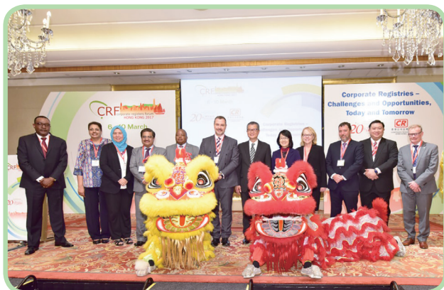
舉辦兩個大型會議 – 「2017公司註冊論壇」及「企業管治圓桌會議」 Organised two major conferences – Corporate Registers Forum 2017 and the Corporate Governance Roundtable